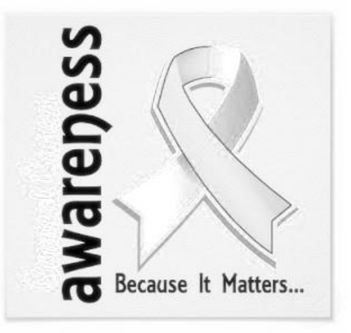
Fig. No. 2 Awareness logo<sup>[40]</sup>

Our awareness of cancer is always intensifying. Surgeons and pathologist taking the advancement of enhanced research studies making our preventions, detect of cervical cancer and cure easy. In that situation we should be also be aware of naïve researches taking place and how we can make them beneficial to us to improve our quality of life. As we all know that our country is a major suffer of cervical cancer curse.